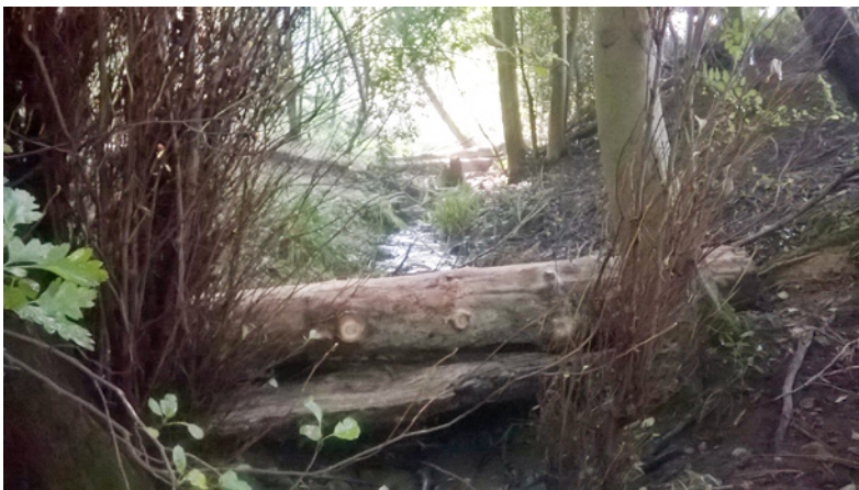
Photo: Large woody debris structure on Wick Street Farm

Like other parts of Gloucestershire, the Stroud Valleys suffered extensive flooding during the summer of 2007. Every year since has seen flooding in some parts of the Stroud Valleys, including most recently Chalford on the middle Frome, and Bridgend and Eastington on the lower Frome.